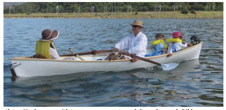
Above: Single rower with two passengers or two adults and several children.

Above: Single rower Below: Single rower with passenger.