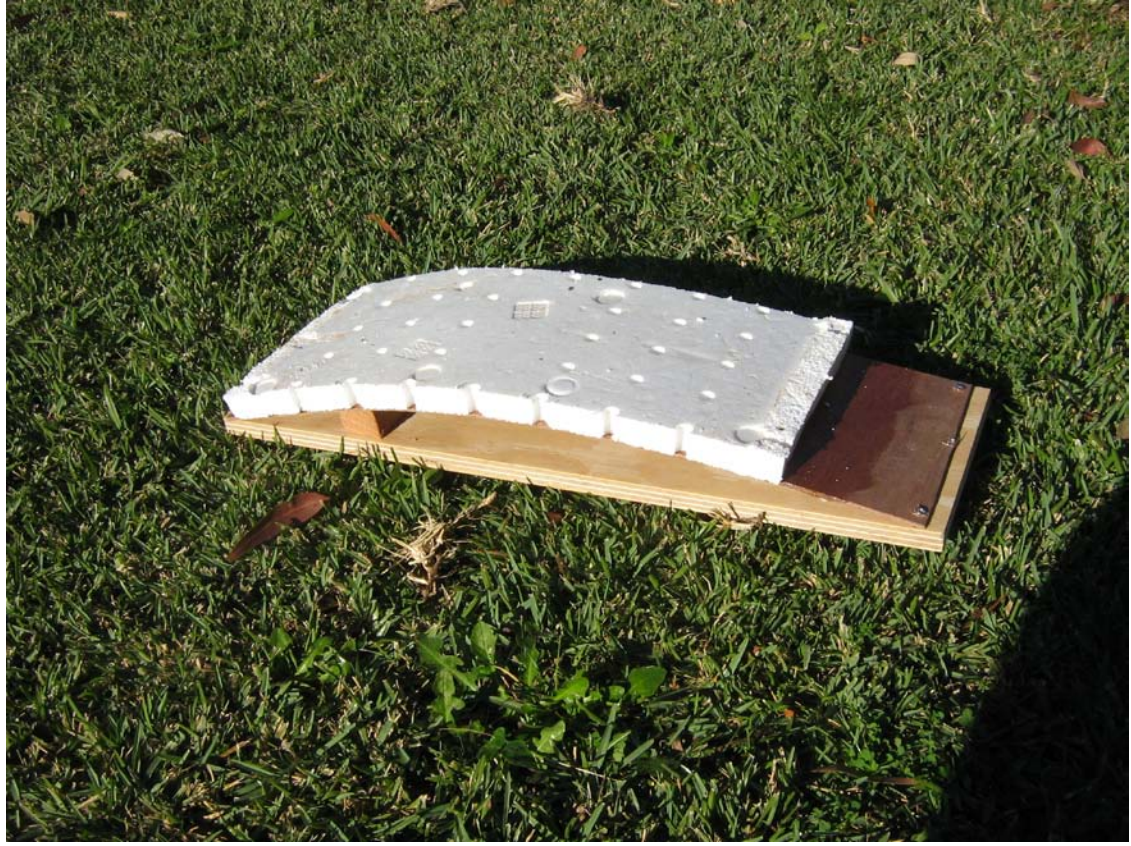
Mould ready for shaping.

1. Make the strong back as shown in the picture using the half inch ply and the 5mm ply with the grain at right angles to allow easy bending. If you have chosen a more extreme curve it will be necessary to cut slits in the foam, which will be filled by resin and micro balloon bog.