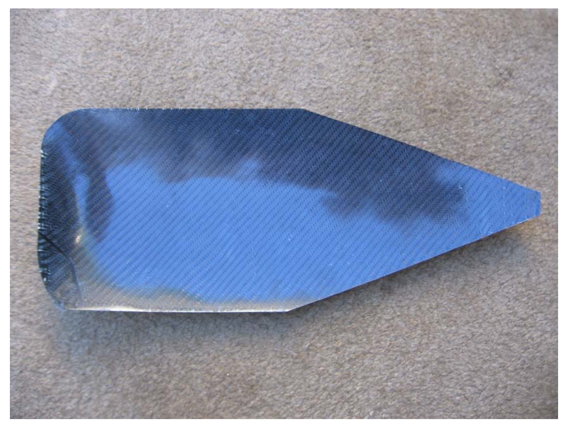
It will help to understand this article if the "Turbo blade" article is read first.

The following article describes the advantages of the carbon fibre blade and how to make one. Not for everybody, but, there are those who will enjoy the creative activity. It may seem a lot of work but if engaged one step at a time can be quite enjoyable. If the time is not available then a blade can be purchased from Gaco to go with the Trapezoidal shaft that is described in "A Superior Oar shaft". This shaft is quite easy and quick to make and is very stiff and light.