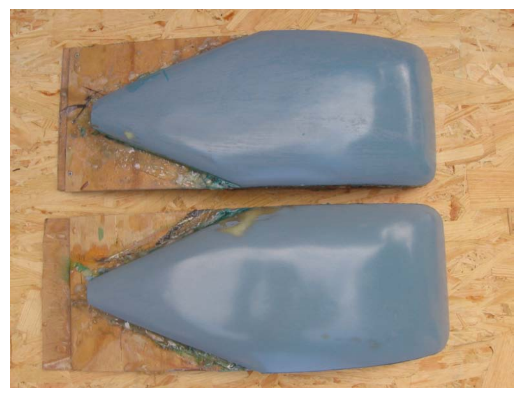
The two asymmetric moulds for the Turbo blade. The curve at the bottom of each blade (outside of picture) is less severe to allow cleaner entry and exit from the water.