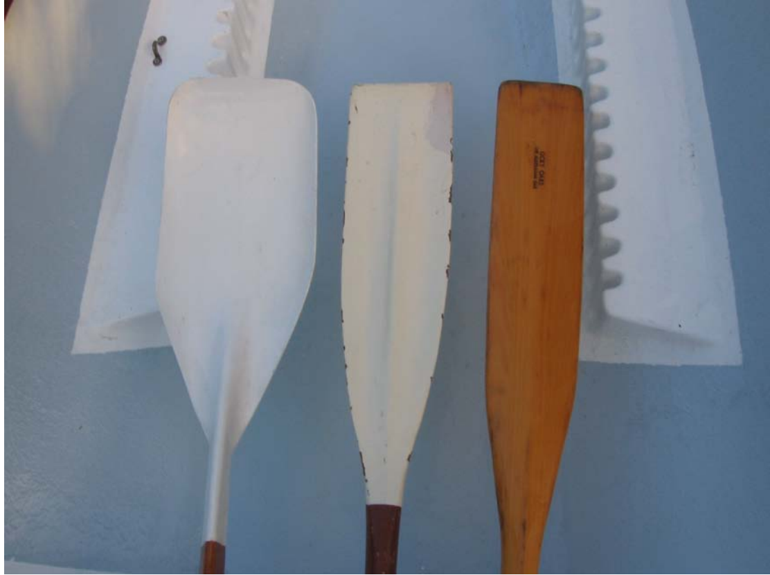
Oars from right to left are, Flat blade, Spoon blade and carbon fibre Turbo blade.

The flat blade is cheap and readily available. However it is cumbersome because the blade is heavy. The spoon blade is a nicely made oar that was commercially available in the middle of the last century, before outboards took over. The Turbo blade has been supplied to customers including a fit young lad who smashed the race record rowing around Dangar Island this year (2012). A review of the statistics for the oars illuminates my comments.