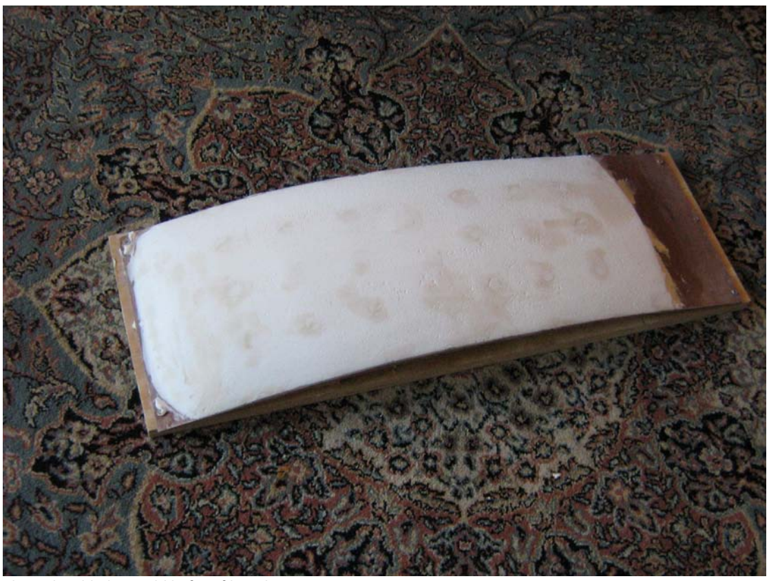
The Sailing blade mould before fibre glassing.