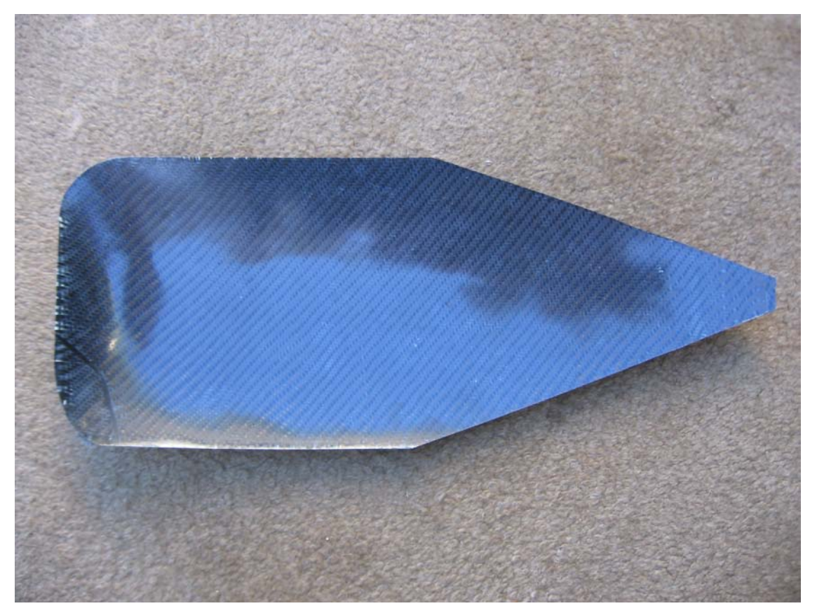
The finished job trimmed with an angle grinder cutting wheel, weighs only 200 grams (7oz.) and is pretty well unbreakable.

In cold weather place in the sun where ultraviolet rays catalyse the reaction. Do not do this in hot weather as the layup will overheat and bond to the mould. Once partly cured it can be placed in a warm indoor environment, without smelling, to prevent permanent under cure.