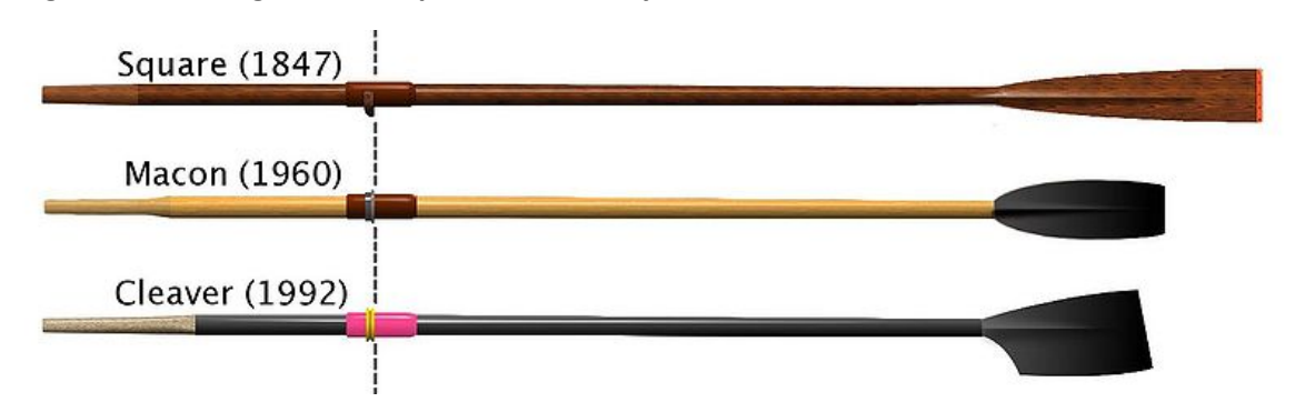
Diagram illustrating oar development over 170 years.

It took over 100 years, for any significant development to take place, when the oars and blades both got shorter. The West German team introduced the Macon blade in1959 where it won all male sweep events except the coxless four. Part of the problem of the long thin blade is that a portion of it moves the wrong way through the water. There is a point of the blade that remains stationary in the water with the portion outboard of the point providing drive and the area inboard providing drag, thereby wasting energy.