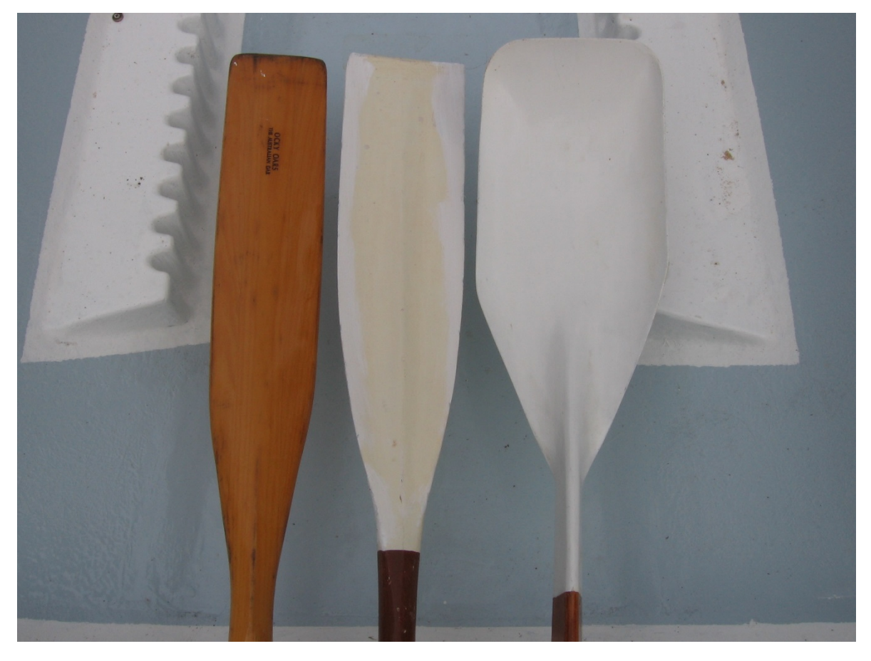
Left to right: Flat blade, 1955 Spoon blade, and the Turbo blade. Could it be that the material used dictates the narrow blades on the first two?

The only reason to use a flat blade is that it is much easier to make but its efficiency is certainly going to be less than the Macon blade by about 30%. Consequently it should be longer even that the square oar. I would suggest in a ratio of 3 outboard to one inboard and a smaller stroke angle. This compares with an astonishing 3.5 to one ratio that I have been able to measure from a photo in the magazine Ash Breeze. Such an oar will have twice the imbalance of an oar with a 2.5 to one ratio. I am aware that the long thin flat blade is allegedly easier to use in a seaway. However I urge you to watch "A surf boat tale" on youtube. Nobody rows in rougher waters than those blokes and you will notice their very fine rowing with heavily spooned oars. The efficiency obviously outweighs the inconvenience of using the broader spoon blade.