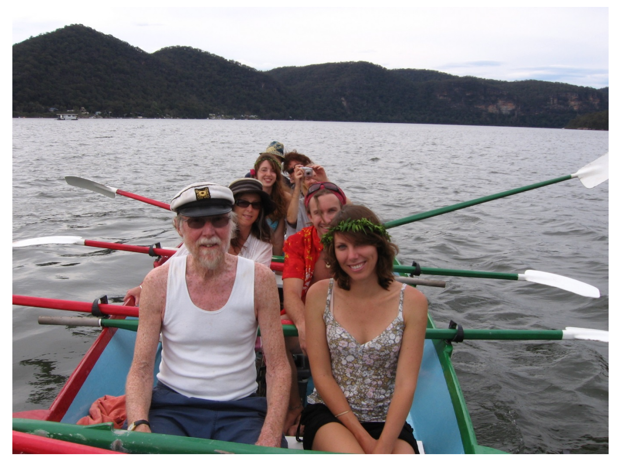
Galley slaves bank oars for a rest with the author as stroke. Drug of choice, exercise induced endorphins

It is the bane of my life getting my galley slaves to take long slow strokes on our excursions. How can I convince them that long slow strokes driven by the strong torso muscles are less effort than arm driven short strokes? I believe that we can improve our rowing by a careful analysis of the ergonomics of the process.