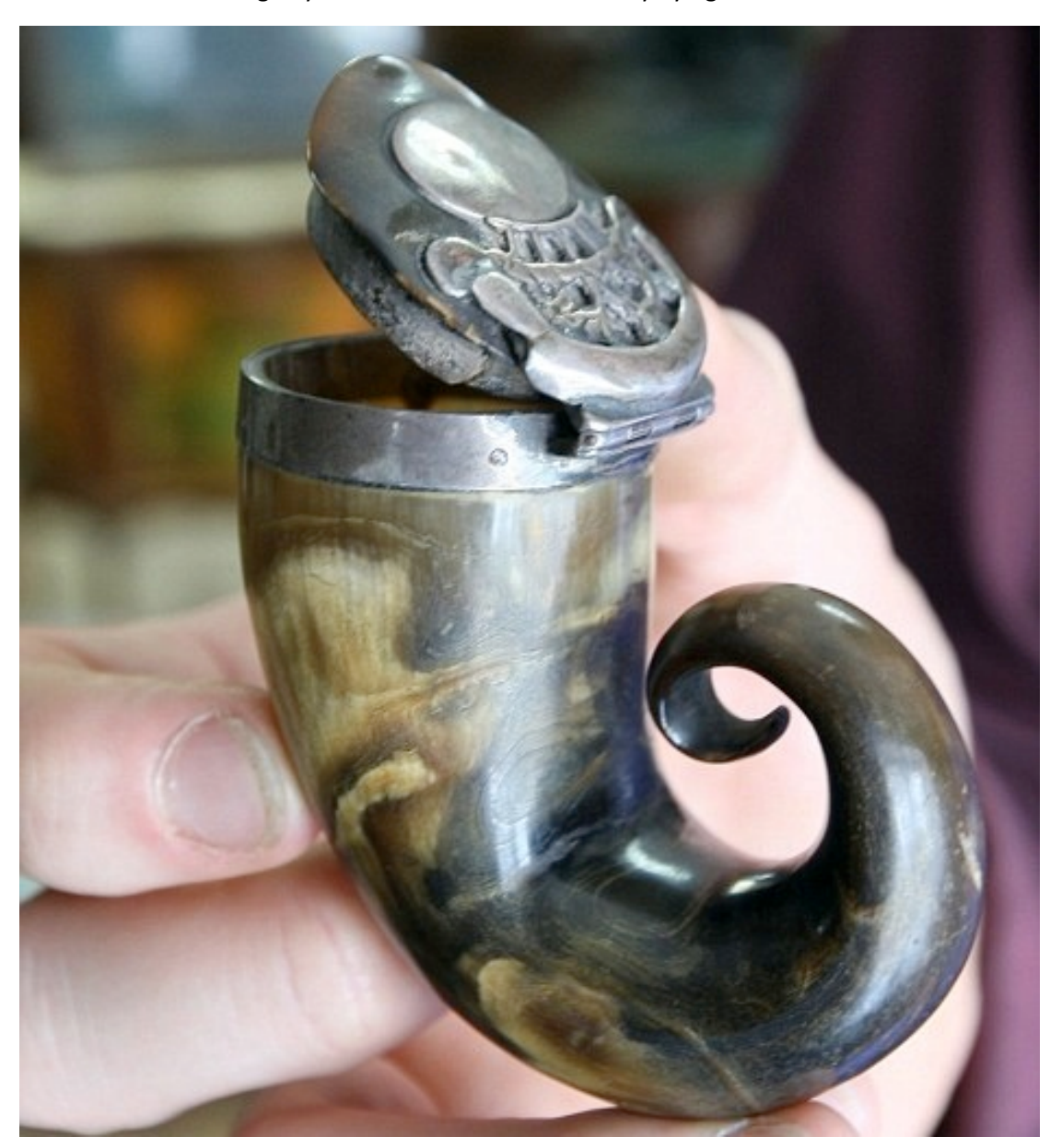
A silver snuffbox allegedly stolen by a sailor from Lord Admiral Nelson's cabin as he lay dying.

Another snuff box allegedly stolen from his cabin as he lay dying was offered for sale in 2010.